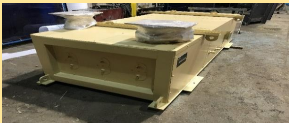
DDI's ECPS™ "Easy Cleaning Ports System"™

SEE YOU AT WEFTEC 2019 Chicago, Booth # 2653