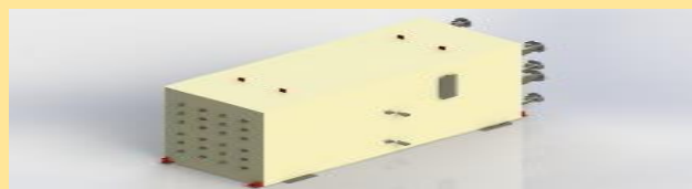
DDI 8 Channels wide model. 2 in 1 FRAME. 2 Circuits.

Directrik Inc. is a distributing company – for pumps, gas compressors, grinders, sludge and scum collection systems, polymer systems, and heat exchangers – based in Milton, Ontario and is recognized as an expert in the water, wastewater, industrial and food processing fields. With over 50 years of collective staff experience in liquid, gas, air and solids handling. The company has represented established firms for over 2 decades.